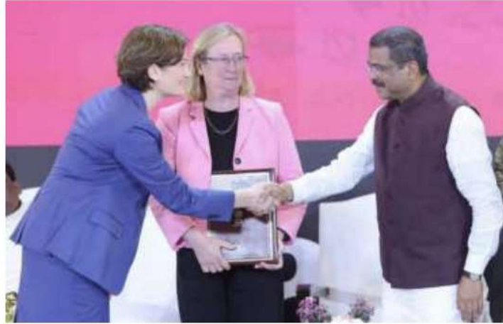
Dharmendra Pradhan issues Letters of Intent to representatives of foreign universities at an event to mark five years of NEP 2020.

“Of these, Australia’s Deakin University and University of Wollongong have already established campus in Gujarat’s GIFT city and U.K.’s Southamp-