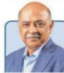
Arvind Krishna CEO, IBM