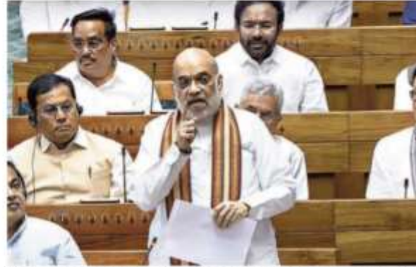
Union Home Minister Amit Shah speaks in the Lok Sabha during the debate on Operation Sindoor on Tuesday.