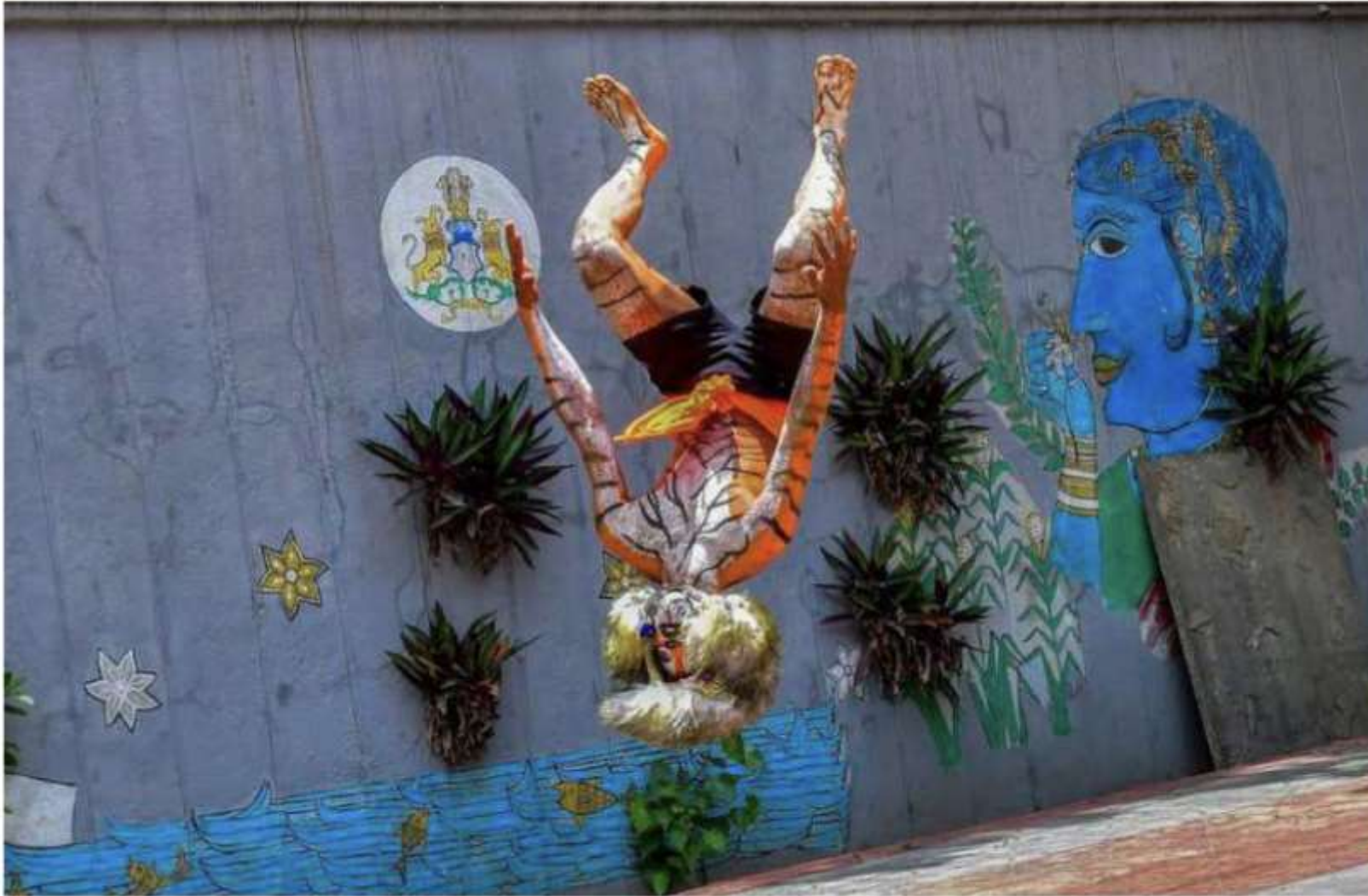
Stripe speak: A folk performer takes part in the International Tiger Day celebrations in Bengaluru on Tuesday. The July 29 event promotes awareness about tiger conservation and threats from poaching.