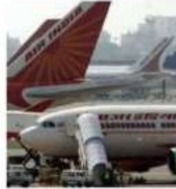
The annual audit was not related to the deadly crash last month in Ahmedabad.

The annual audit was not related to the deadly Boeing 787 crash last