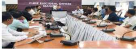
Revision exercise: A meeting between election officials and representatives of political parties was held in Imphal on July 25 to discuss the revision of electoral rolls, government.

According to notification made public by the office of the district Election Officers across Manipur for meeting with political parties, there is a reference to "the ongoing special intensive revision".