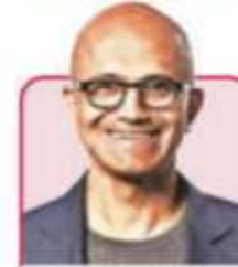
Satya Nadella CEO, Microsoft