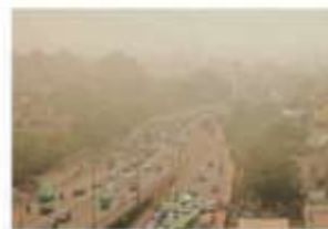
Delhi covered in a thick blanket of smog in 2023.

Over the years, scientists have proposed several mechanisms to explain how air pollution may cause dementia. These primarily involve inflammation in the brain and oxidative stress (caused by