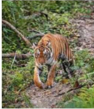
A royal Bengal tiger inside the Kaziranga National Park.

The report stated that 148 tigers were recorded across the 1,307.49-sq. km expanse of the KTR in 2024. The “remarkable” increase since the 2022 estimation was attributed to