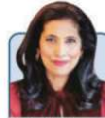
Leena Nair CEO, Chanel