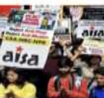
Disputed projects: Activists protest against the CAA, NRC and NPR at Jantar Mantar in New Delhi in March 2020.