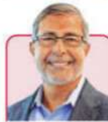
Sanjay Mehrotra CEO, Micron