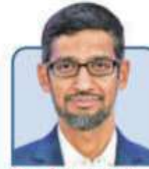
Sundar Pichai CEO, Alphabet