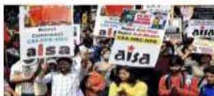
Disputed projects: Activists protest against the CAA, NRC and NPR at Jantar Mantar in New Delhi in March 2020.