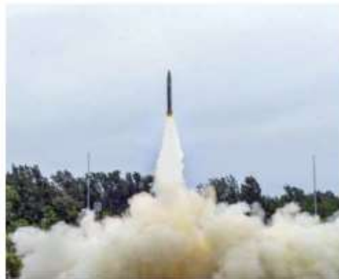
The DRDO successfully conducted two consecutive flight-tests of Pralay missile off the coast of Odisha on Tuesday.