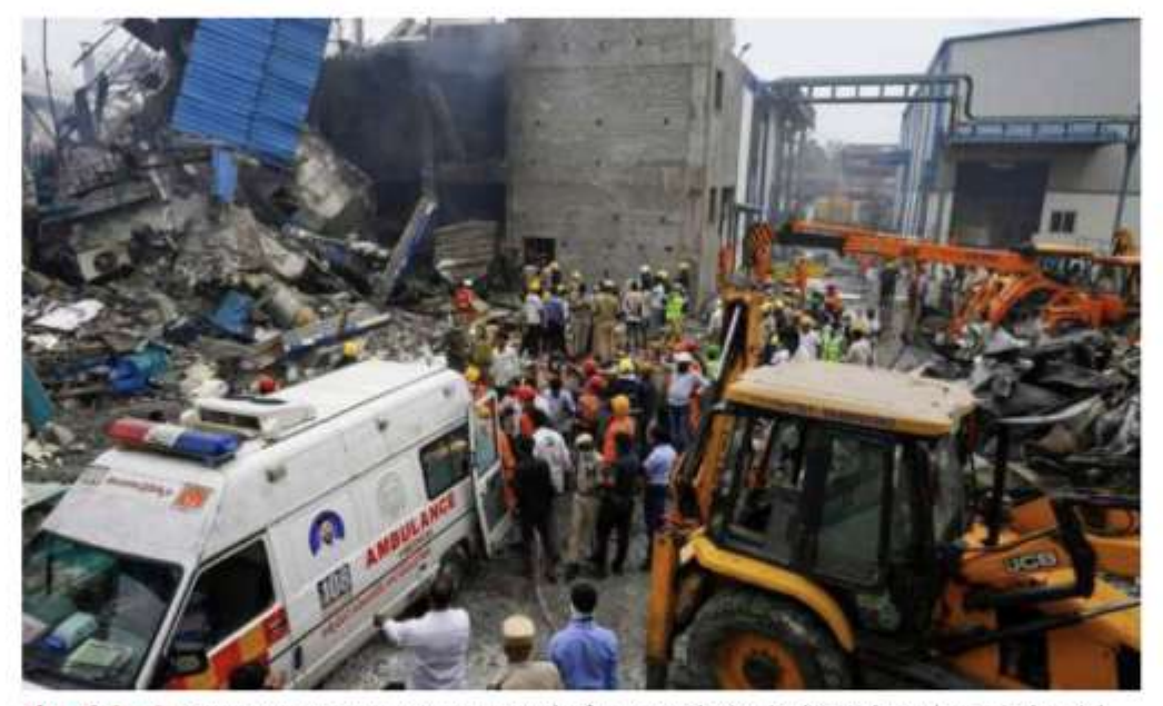
Site of shock: Emergency response teams at work after an explosion in the Pashamylaram industrial area in Sangareddy of Telangana on Monday.

Vehicles were rushed from as far as Secunderabad (40 km away) and Rajendranagar fire stations (45 km). Rescue efforts continued late into the evening, with teams carefully combing through the debris for any survivors or victims.