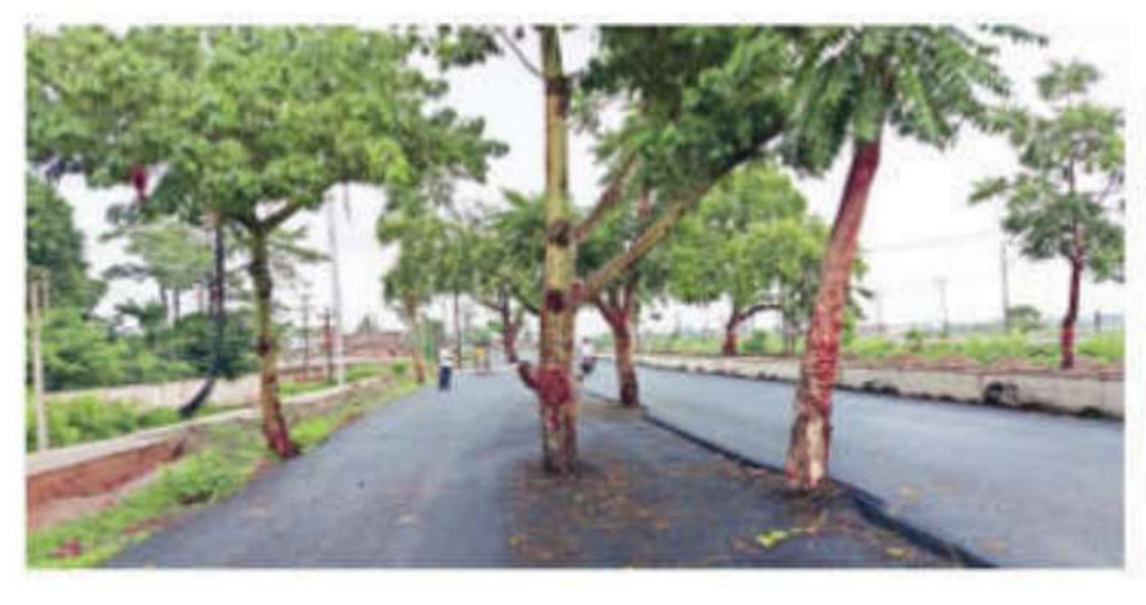
The Patna-Gaya road in Jehanabad district. Express

Several people took to social media, putting up photos and videos of the road, and commenting on the danger that the trees in the middle posed to commuters. The trees, many of the posts pointed out, are not