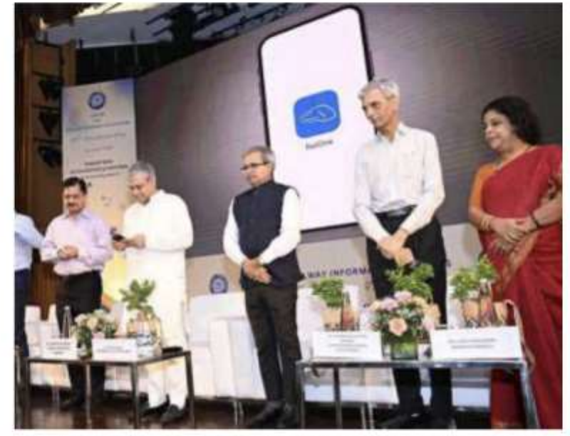
Union Minister Ashwini Vaishnaw during the launch of the RailOne app at the India Habitat Centre in New Delhi on Tuesday.

The RailOne app integrates all passenger services, including a 3% discount on unreserved tickets and platform tickets, live train