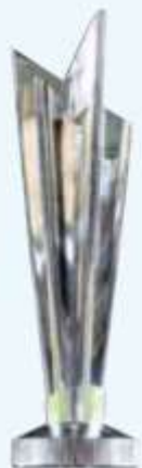
ICC Men's T20 World Cup | February 7-March 8 | India & Sri Lanka