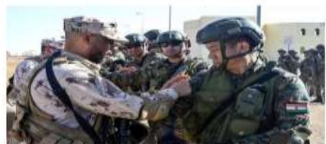
Brothers in arms: The Indian contingent and UAE Land Forces carried out progressive practical drills during the joint training at the Al-Hamra Training City, December.

The Indian contingent comprised 45 personnel, primarily from a battalion of the Mechanised Infantry Regiment, while the UAE Land Forces were represented by the 33 Mechanised Battalion. The request for assistance was made during the inauguration of the airport by President Droupadi Murmu on November 9, 2025, by President Mohamed Nasheed to Civil Aviation Minister K. Ramamohan Naidu, who