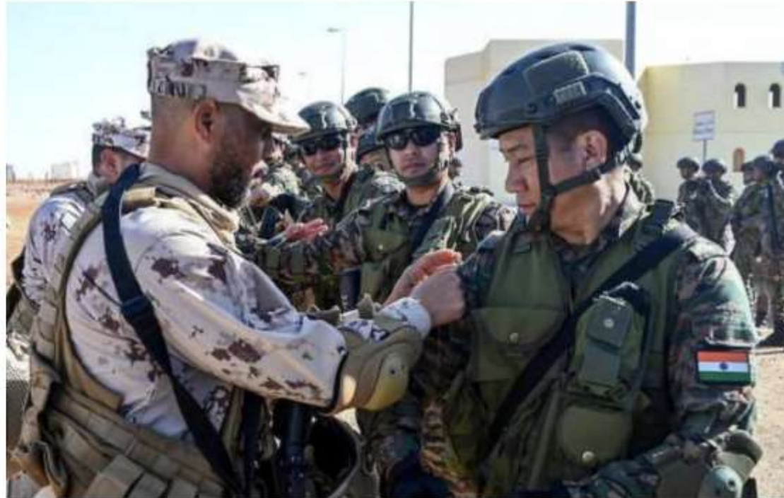
Brothers in arms: The Indian contingent and UAE Land Forces carried out progressive practical drills during the joint training at the Al-Hamra Training City.

The exercise featured classroom instruction and field-based training aimed at enhancing interoperability, mutual trust and operational synergy in an urban environment, with emphasis on sub-conventional operations under a United