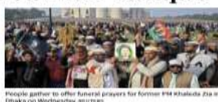
People gather to offer funeral prayers for former PM Khabila Zia in Dhaka on Wednesday.

This is the first visit by Mr. Jaishankar to Dhaka since the interim government. Union Minister Ashwini Vaishnaw, who made announcements at the cabinet's decision on the day's meeting, said the government had not included this development in his prepared remarks.