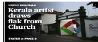
KOCHI BIKER Kerala artist draws flak from Church STATES > PAGE 3