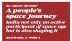
AN INDIAN ODYSSEY A people's space journey India not only an active participant of space age but is also shaping it EDITORIAL > PAGE 8