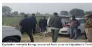
Explosive material being recovered from a car in Rajasthan's Tonk district on Wednesday.