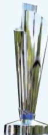
ICC Women's T20 World Cup | June 12-July 5 | England & Wales