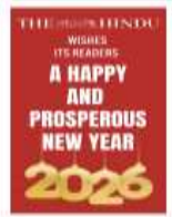
THE HINDU WISHES ITS READERS A HAPPY AND PROSPEROUS NEW YEAR

NEW DELHI The Centre has asked the Airports Authority of India to study a request from the Maldives seeking assistance of Indian companies to manage its recently upgraded Hanimaadhoo International Airport. The request comes over a decade after Maldives terminated a contract with Indian firm conglomerate GMR to develop the Male International Airport. > PAGE 8