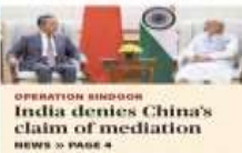
OPERATION SINDOOR India denies China's claim of mediation NEWS > PAGE 4