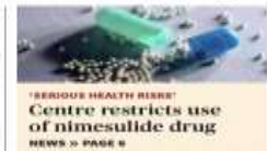
'SERIOUS HEALTH RISK' Centre restricts use of nimesulide drug NEWS > PAGE 5