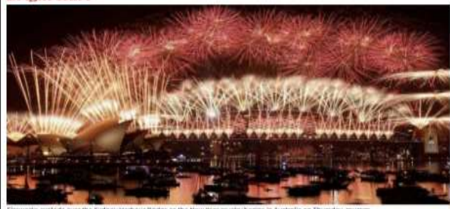
Fireworks explode over the Sydney Harbour Bridge as the New Year revelry begins in Australia on Thursday.