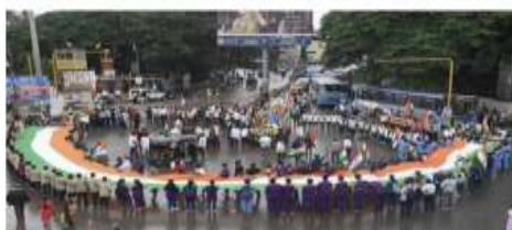
United we stand: People take part in a Tinsaga rally after Operation Sindoor in May 2023. India has consistently said that there was no third party intervention that brought about a ceasefire.