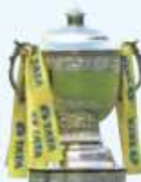
Indian Premier League | March-May