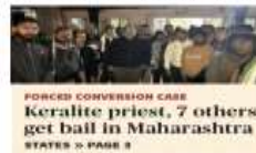
FORCED CONVERSION CASE Keralite priest, 7 others get bail in Maharashtra STATES > PAGE 3