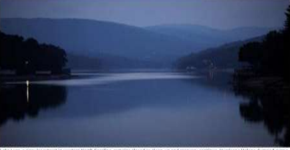
Lake Lurs, a popular retreat in weatern fronth Carolina, remains closed as clean-up and recovery continue. Hunicane Helene dumped over a miliser eable yards of definis into the false, disrupting tourism and imparting the local economy, securies