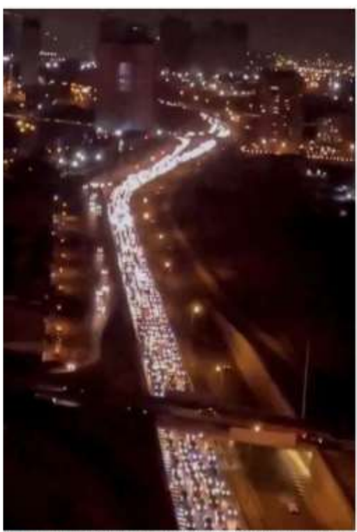
Rush hour: Videograb of vehicles moving out of Tehran on Sunday night as Israel and Iran continue to attack each other.

"Some Indians have been facilitated to leave Iran through the border with Armenia," the Minis-