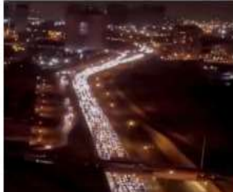
Bush hours Videografs of vehicles moving out of helican only to a load state and true monthing to alload each other, no

try of External Affairs said in an anisomers on Tuesday morning, adding that further advisories will be issued depending on the "fluid situation".