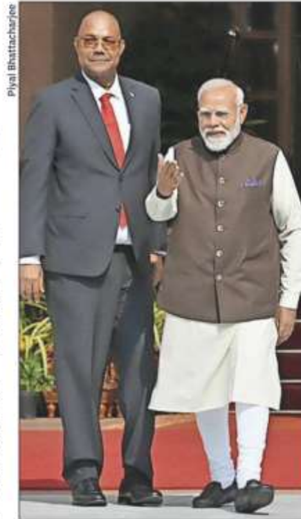
PM Modi hosted Seychelles President Patrick Herminie in New Delhi on Monday

Modi described defence cooperation and maritime security as important pillars of the bilateral relation-