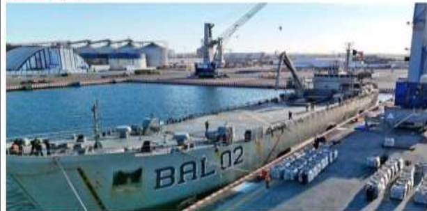
Bound to humanity: Sailors loading humanitarian aid onto one of two ships carrying humanitarian aid to Cuba, which will be departing from the Port of Veracruz, in the state of Veracruz, Mexico. Mexico will ship humanitarian aid to Cuba in the coming days while continuing to negotiate with Washington on the possibility of resuming a U.S. oil deal. President Claudia Sheinbaum said.